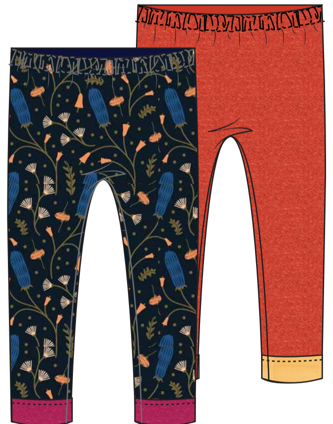
PRINTED JERSEY & MARL JERSEY LEGGINGS WITH CONTRAST COLOUR AND FABRIC ELASTICATED CUFFS