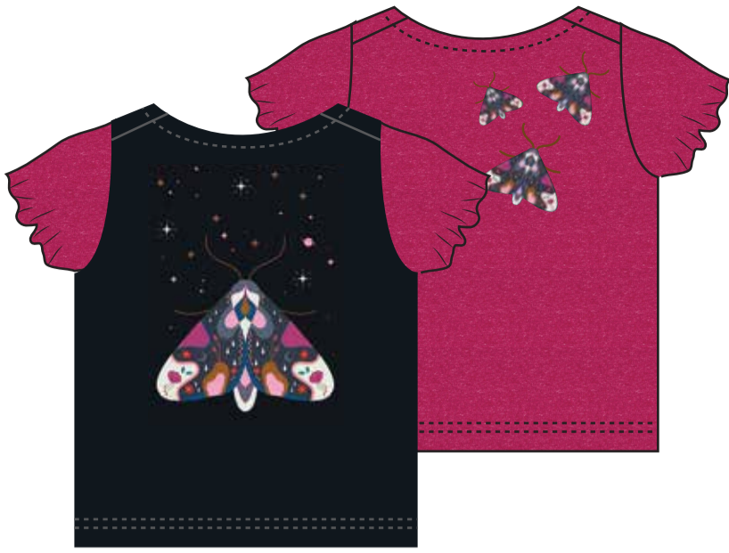
JERSEY T-SHIRTS WITH LETTUCE HEM SLEEVES AND MIXED APPLIQUE AND EMBROIDERY