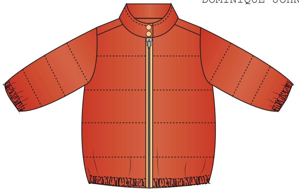
SHINY POLYESTER PUFFER JACKET WITH CONTRAST METAL PRESS STUDS, PLACKET AND CHUNKY ZIP