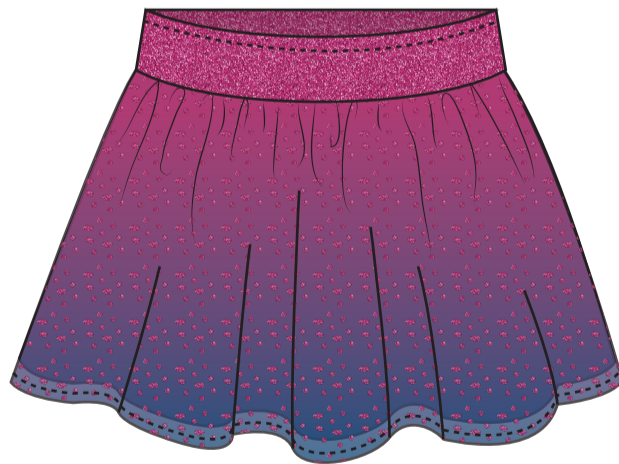
OMBRE CHIFFON AND POLYESTER SKIRT WITH CHUNKY ELASTICATED LUREX WAISTBAND, WITH GLITTER PRINT TO TOP SKIRT LAYER