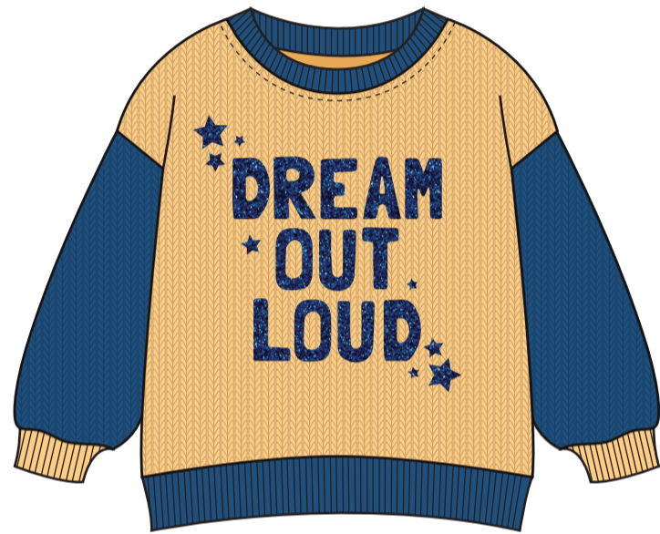
CHUNKY STOCKINETTE JUMPER WITH CONTRAST SLEEVES AND CUFFS WITH INTARSIA LUREX TEXT