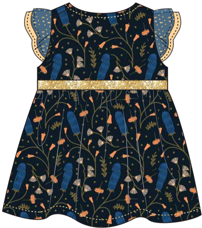
PRINTED JERSEY DRESS WITH LUREX WAISTBAND AND LAYERED MESH FRILL SLEEVES WITH GLITTER PRINT