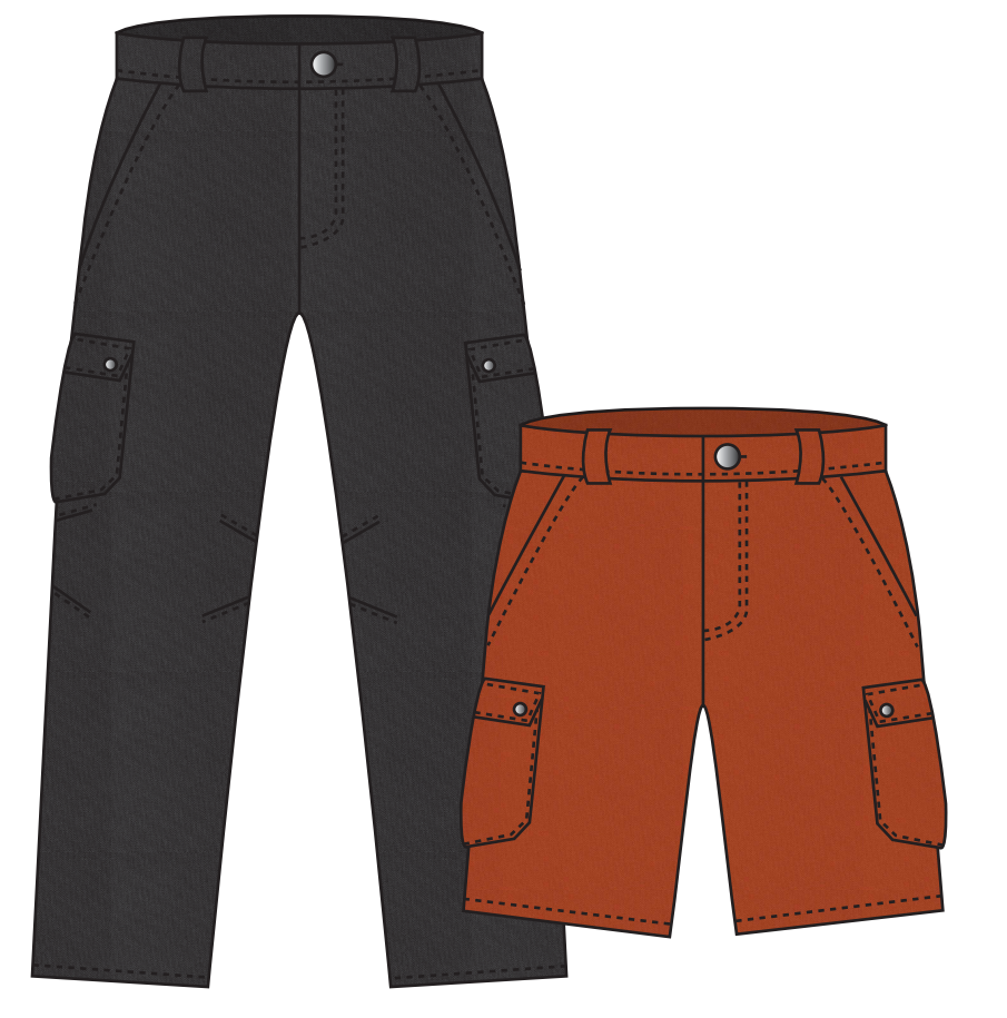
WAX FINISH CARGO PANTS & SHORTS WITH DIAGONAL & PATCH POCKETS