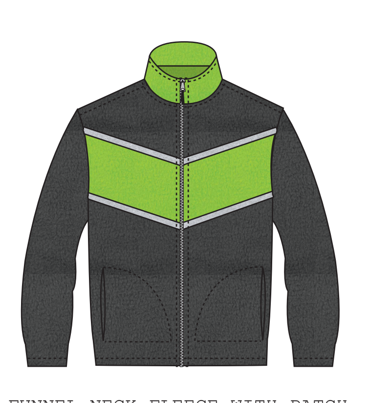
FUNNEL NECK FLEECE WITH PATCH POCKETS AND CONTRAST PANELS