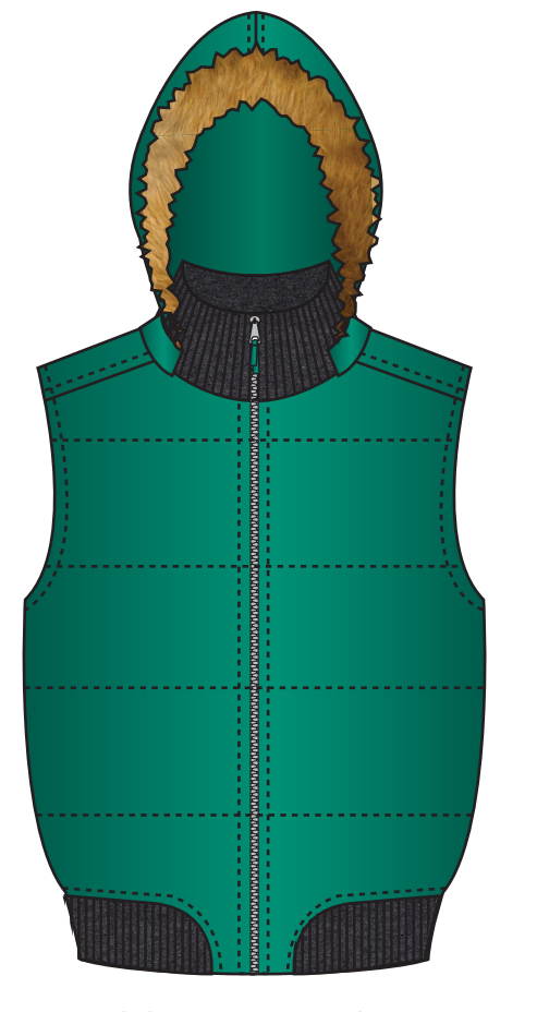
SLEEVELESS PUFFA GILET WITH CONTRAST RIB & FUR PANELS