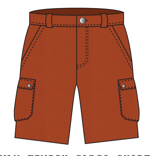
WAX FINISH CARGO SHORTS WITH DIAGONAL & PATCH POCKETS