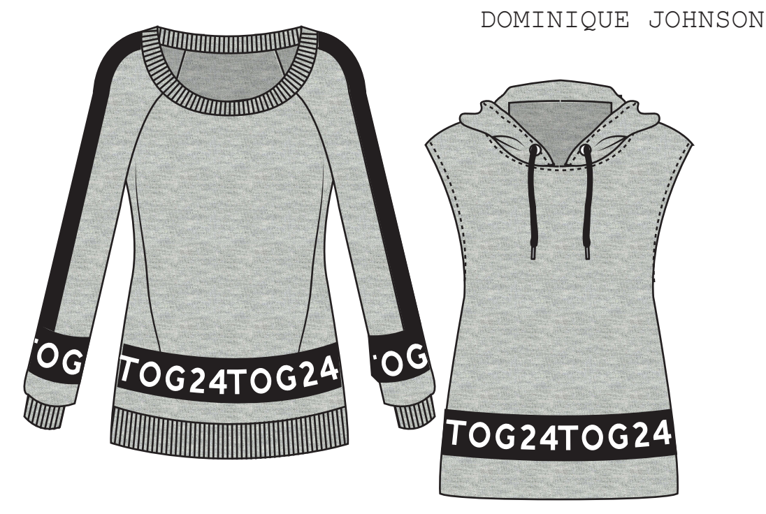
JERSEY SWEATER & HOODIE WITH CONTRAST PANELS WITH REPEATING LOGO PRINT