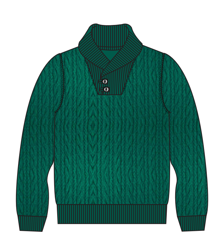
WRAP COWL NECK CABLE KNIT JUMPER WITH RIB & BUTTON DETAIL