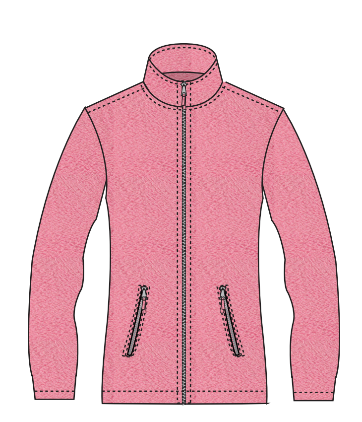
FUNNEL NECK FLEECE WITH DIAGONAL POCKETS AND CF ZIP