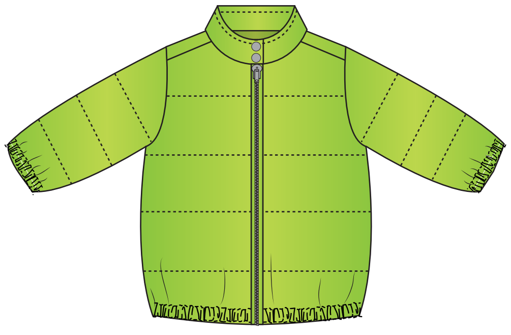
SHINY DOWN-FILLED PUFFA JACKET WITH METAL HARDWARE

POLO SHIRT WITH SIDE SEAM SPLITS, CONTRAST GRADIENT STITCH, LOGO & BUTTONS