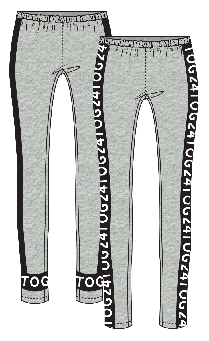
JERSEY LEGGINGS WITH CONTRAST PANELS WITH REPEATING LOGO PRINT