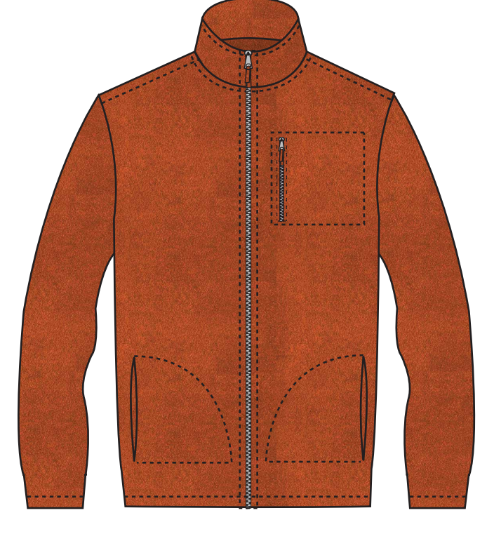
FUNNEL NECK FLEECE WITH PATCH POCKETS AND CF ZIP