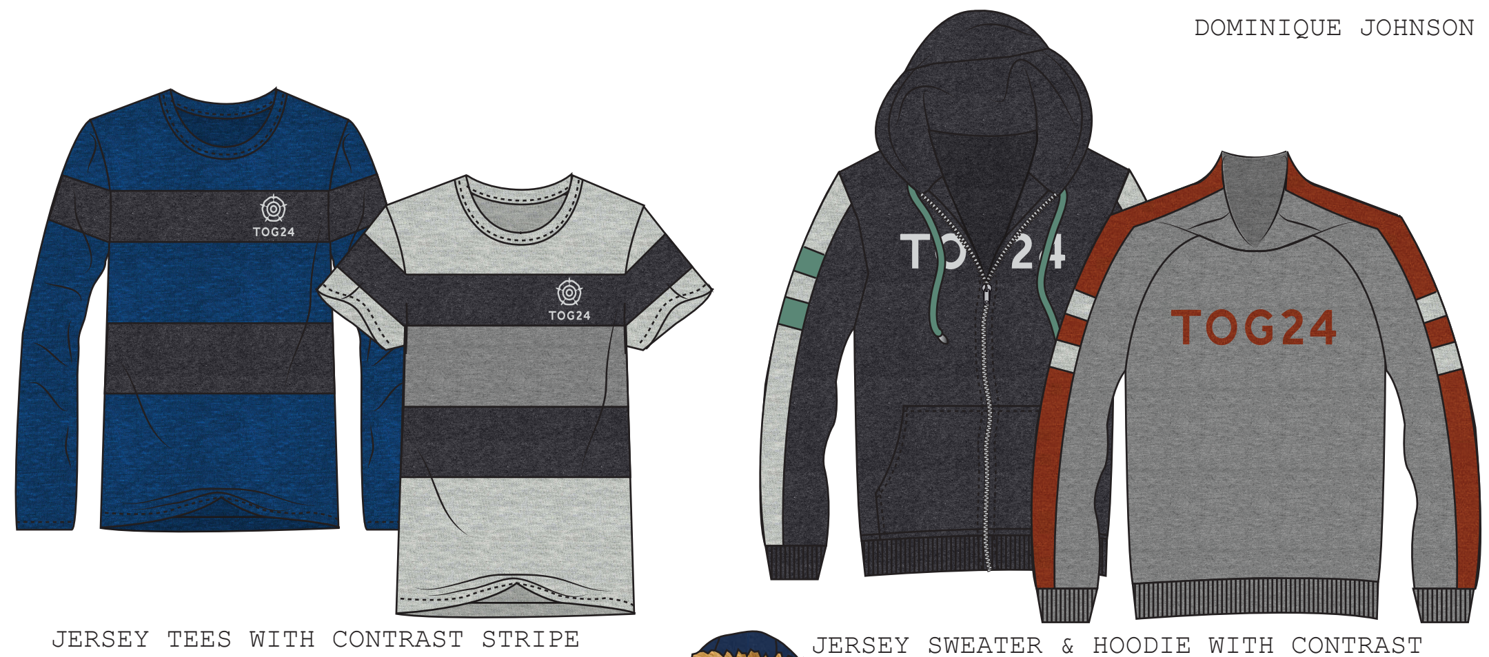
JERSEY TEES WITH CONTRAST STRIPE & LOGO DETAIL