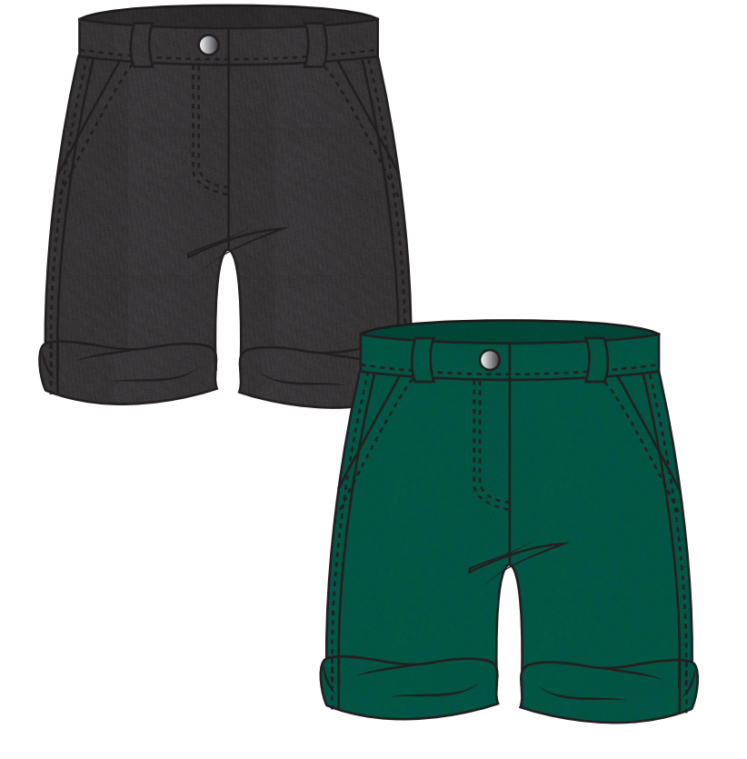
COTTON RICH CARGO SHORTS WITH DIAGONAL POCKETS