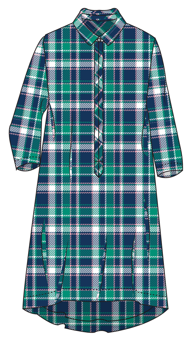
BRUSHED WOVEN SHIRT DRESS