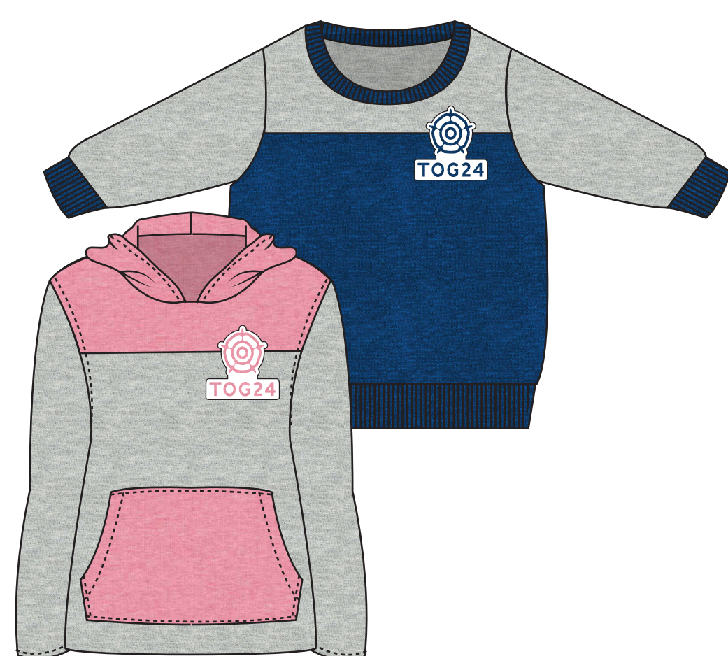
JERSEY SWEATER & HOODIE WITH CONTRAST PANELS AND BRUSHED EMBROIDERY LOGO PATCH