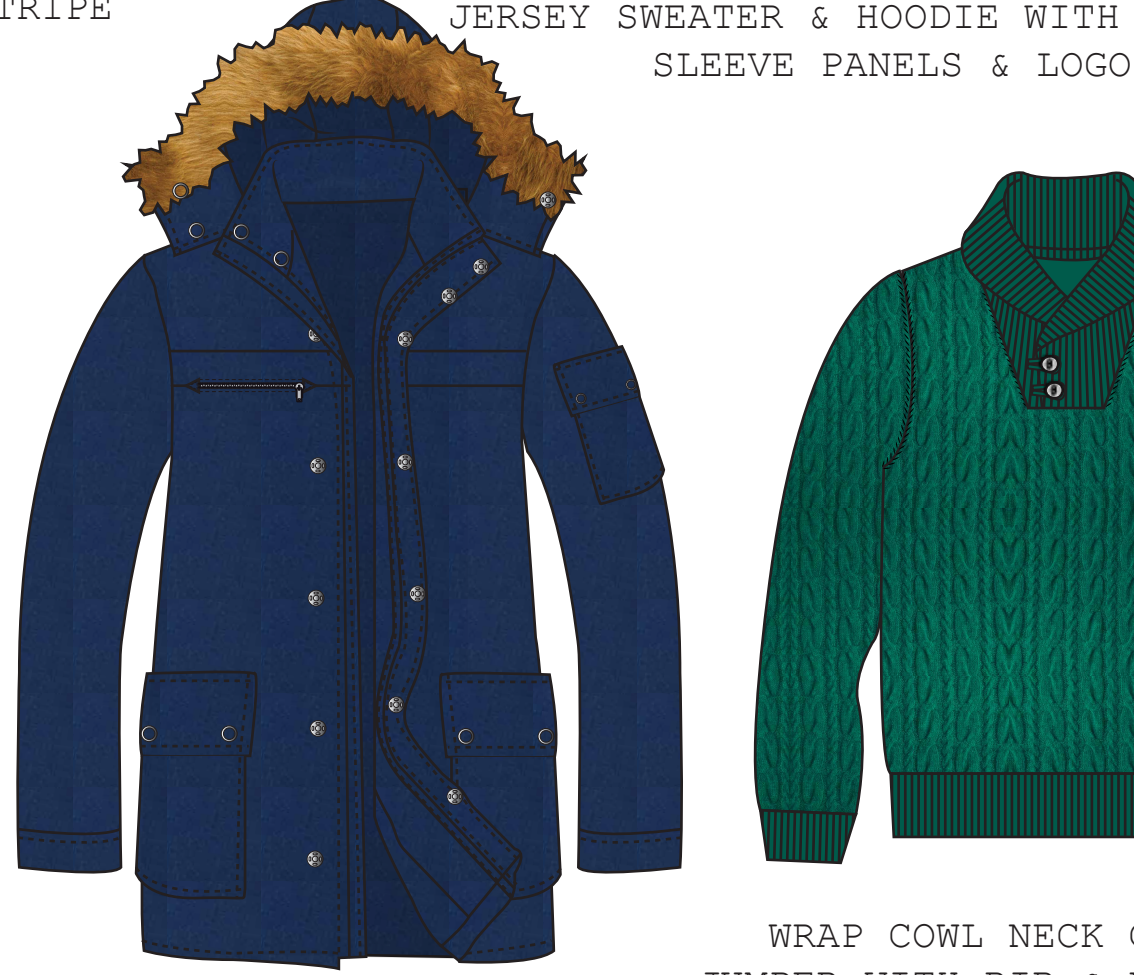
WAXED PARKA WITH CONTRAST FUR TRIM & HARDWARE