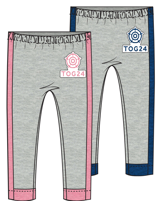
JERSEY LEGGINGS WITH CONTRAST PANELS AND BRUSHED EMBROIDERY LOGO PATCH